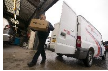
Unipart Automotive delivers