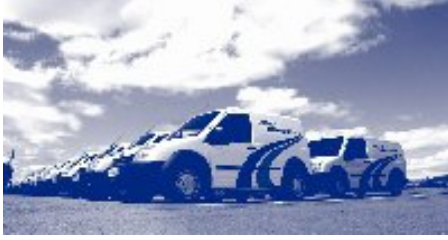
Unipart Automotive vans